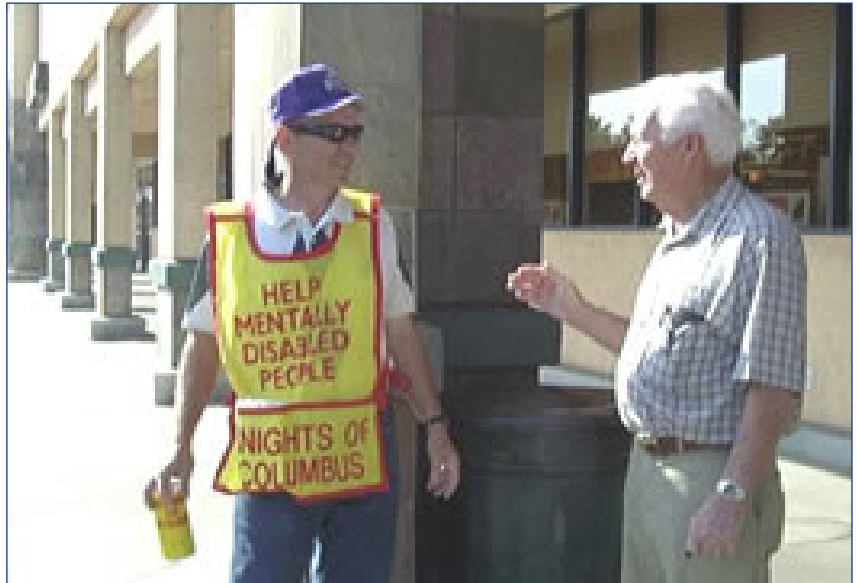
Volunteers will be on duty at local stores this month to accept contributions.