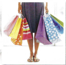
Big Savings on Shopping, Services & Entertainment