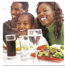
Up to 50% off Eating Out